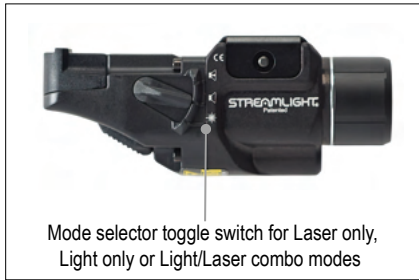
Mode selector toggle switch for Laser only, Light only or Light/Laser combo modes